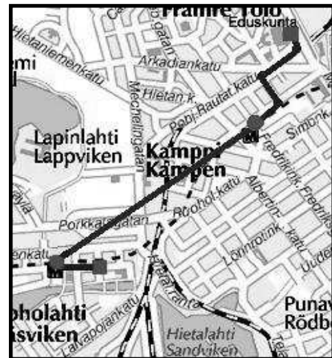
Figure 3. Sample graphical representation of a route (verbal route description in example dialogues 3 and 4).

As pointed out by [2], one important aspect in route navigation is to be able to give the user information that is suitably chunked. The initial response the system produces for a valid route query is a route summary, based on which the user is able to accept or decline the fetched route. The spoken summary contains the time of departure, the form of transportation, the line number (where applicable), the number of changes from a vehicle to another, the name or address of the final destination, and the time of arrival. The route suggestion is also displayed on the map as shown in an example in Figure 3.