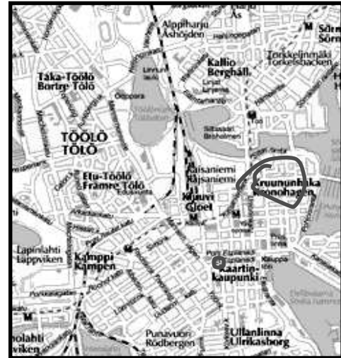
Figure 1. Sample tactile input.

S: Walk 200 meters in the direction of the bus route. You are at Brahe Street 7. U: How long does it take? S: It takes 19 minutes. U: I see, ok.